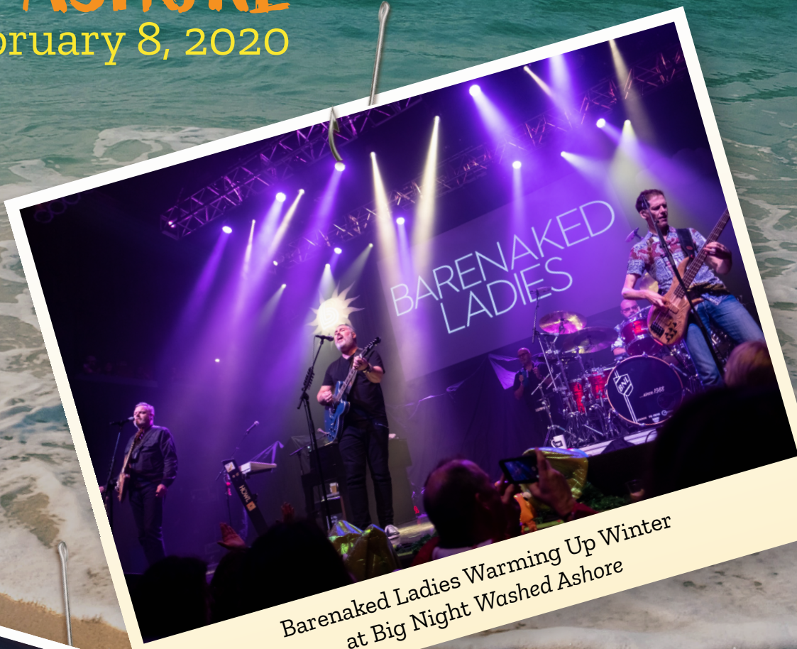
Barenaked Ladies Warming Up Winter at Big Night Washed Ashore