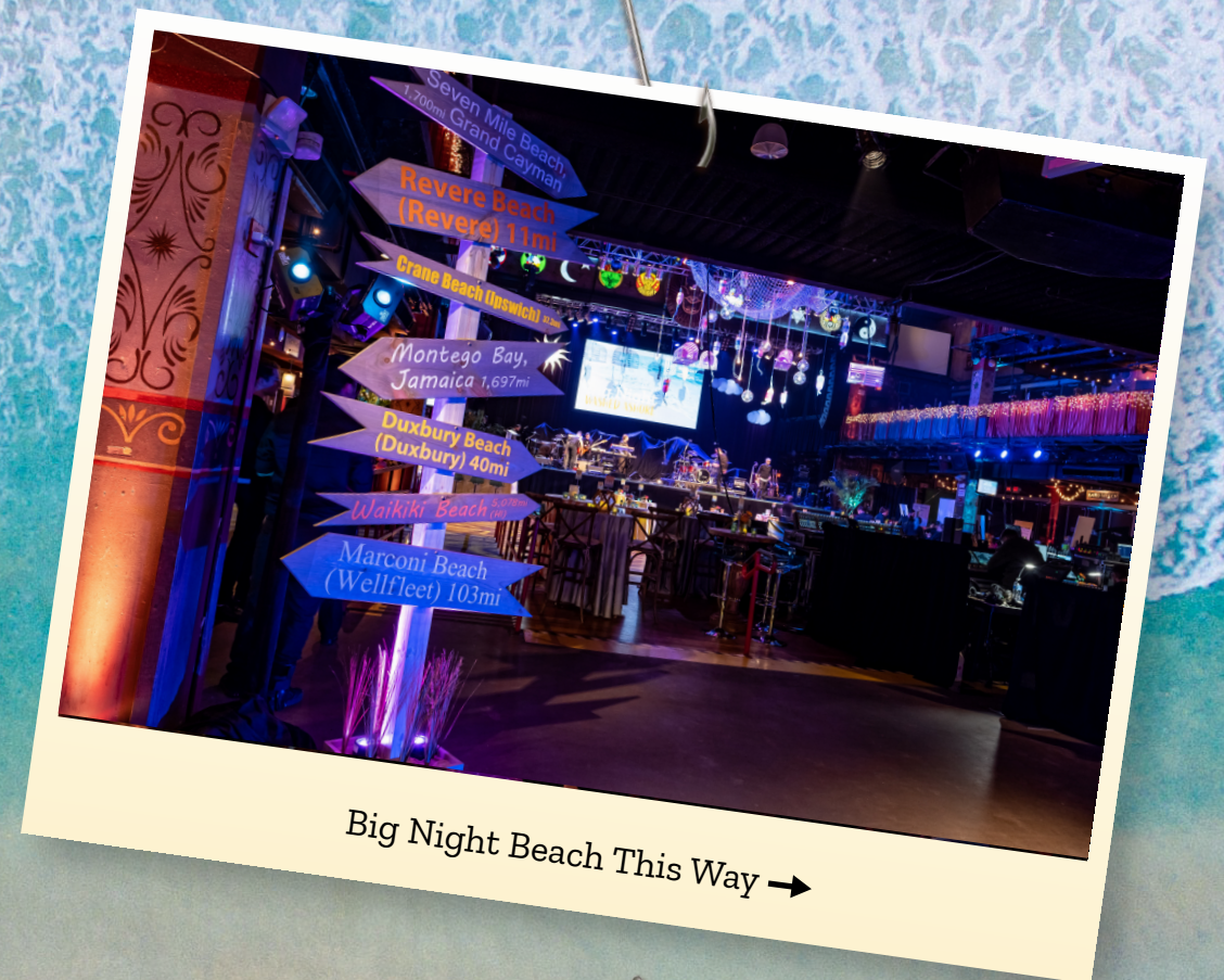
Big Night Beach This Way →

For more information, please contact Christa Danilowicz at cdanilowicz@capebig.org .