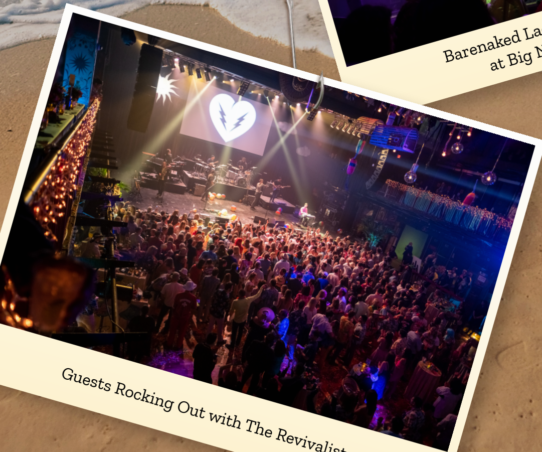
Guests Rocking Out with The Revivalists